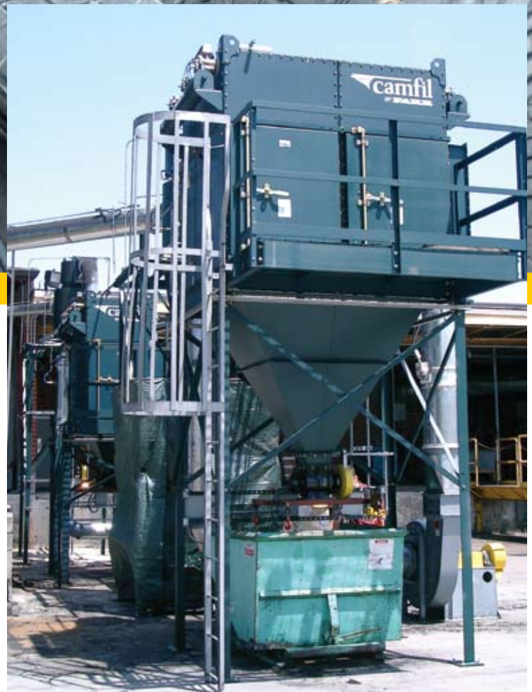
GS12SQ With Platform on Rubber Grinding

Rubber grinding applications pose multiple challenges for industrial dust collectors. Oils in the rubber are typically the biggest problem. In horizontal cartridge collectors, the filters get saturated and the pleats fail. Heat is also an issue as hot pieces of materials can lay into the horizontal cartridges and burn the filter media. Rubber grinding dust has an explosive nature, and there are also hazards having to do with the hydrocarbons being released.