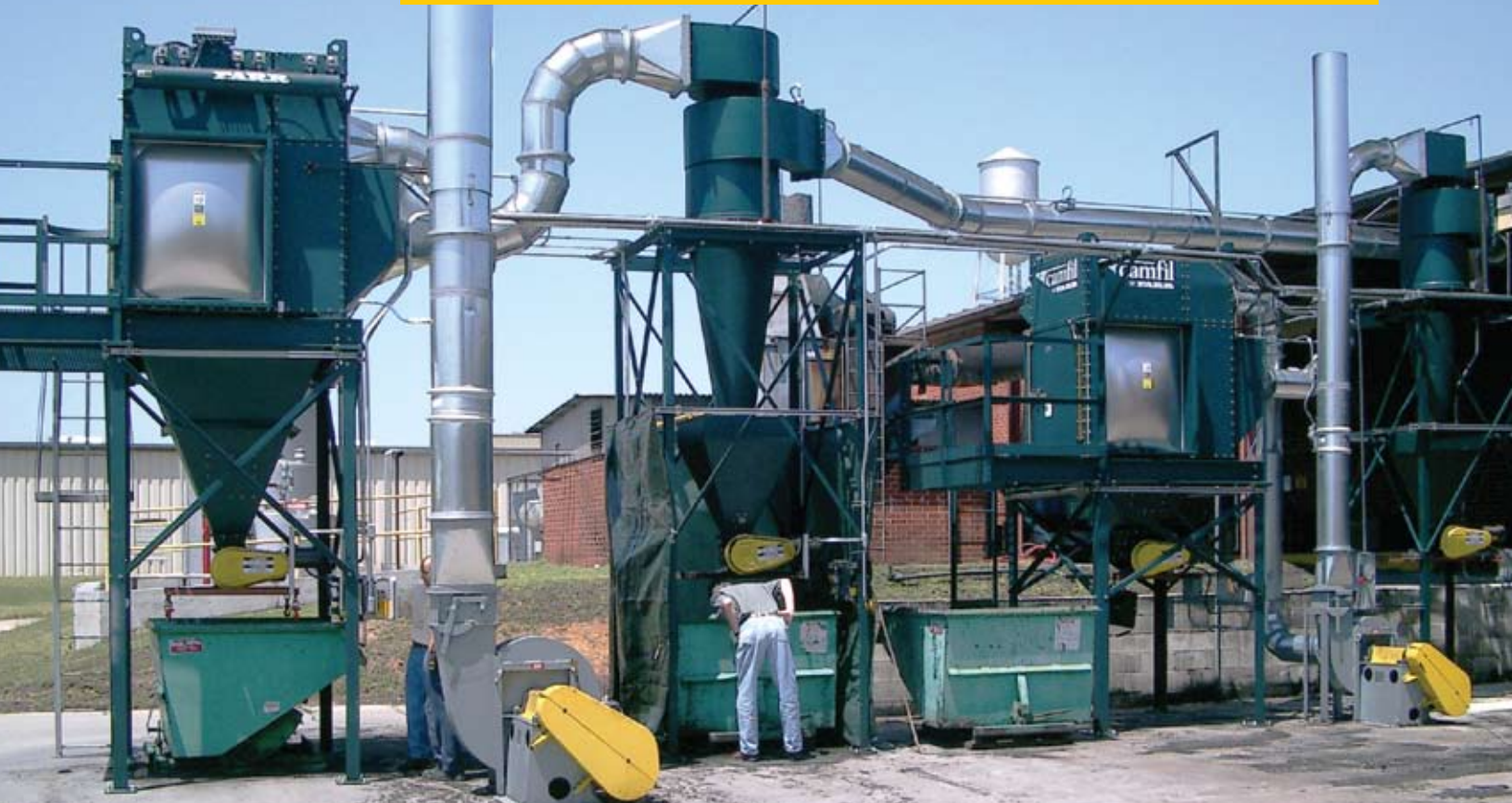
Rubber Automotive Belt and Tire Grinding Installation

The Gold Series® offers the best solution for dust and fume collection in rubber grinding applications. With its vertical cartridge design, oil is not prone to soak the media. Vertical, wide pleats allow easier discharge of both fine rubber dust and large rubber particles. The Gold Series® offers an optional spark trap inlet design and explosion vents. HemiPleat® High Efficiency (HE) filters capture the smoke associated with the rubber grinding process.