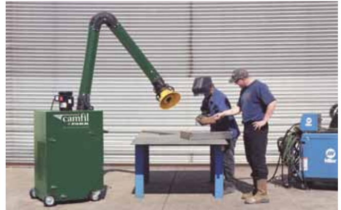
Zephyr III In Action

Fume arms are available separately in 2 metre or 3 metre lengths.