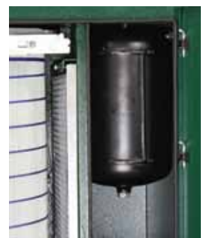
Zephyr III Cleaning Tank